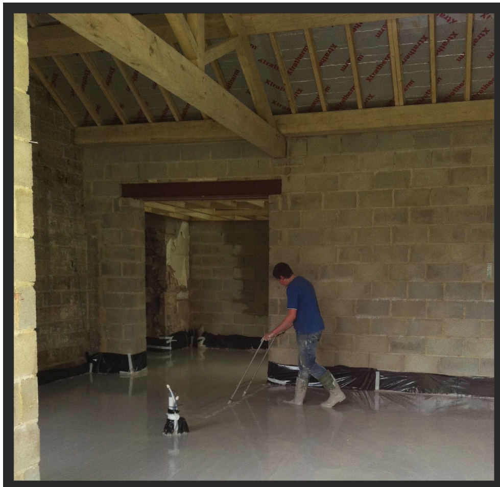
Above preparing the floor in the kitchen. The restoration work used fourteen tonnes of authentic lime plaster on the walls. Some 50 to 60 bags of sheep